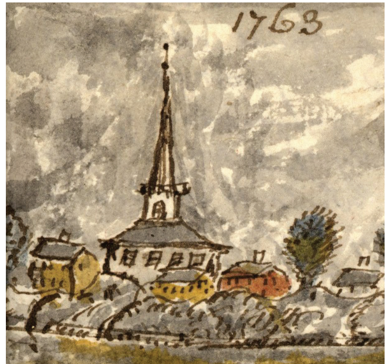
ABOVE: Detail of Ashley Bowen watercolor, 1763. Marblehead Museum Collection.