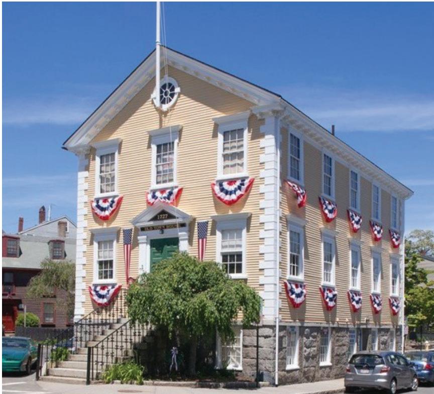
ABOVE: Old Town House, photo by Rick Ashley.