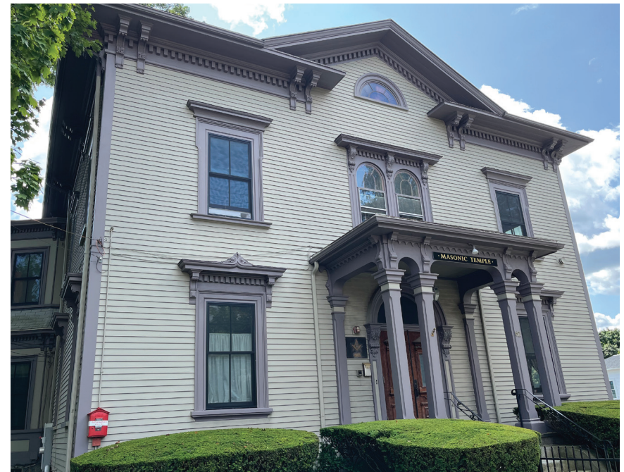
ABOVE: Masonic Hall, Marblehead, MA