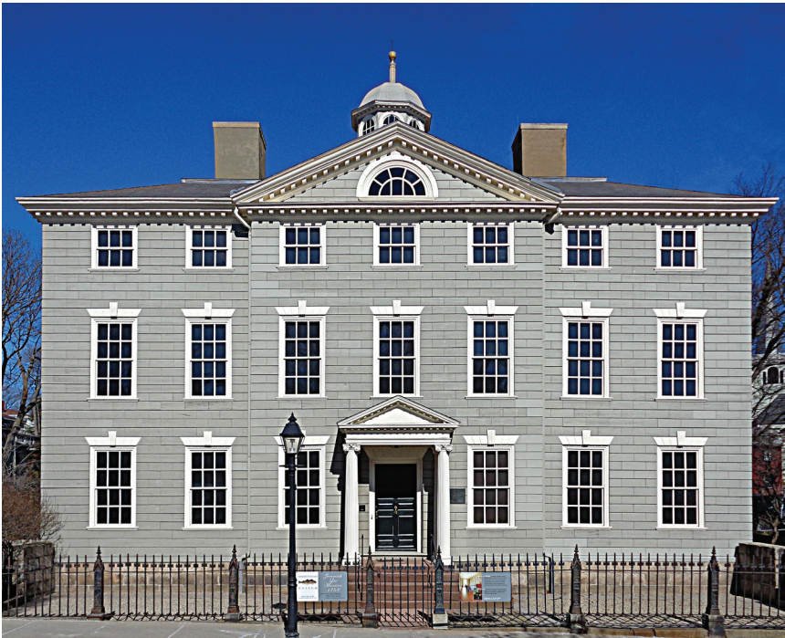
ABOVE: Jeremiah Lee Mansion.