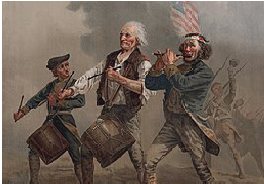
ABOVE: "Spirit of '76," Archibald Willard, 1876.

Open House, Saturday 11am – 3pm; Sunday 12pm – 3pm