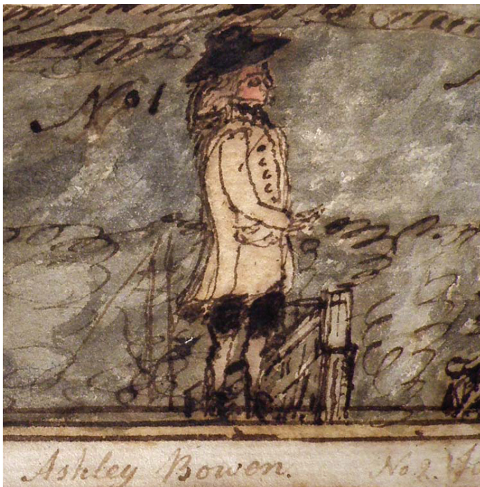
ABOVE: Ashley Bowen, Self-portrait, detail. Marblehead Museum Collection.