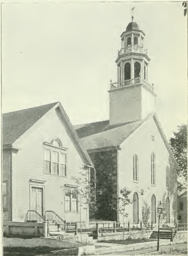
CHURCH AND CHAPEL, 1901