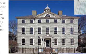
TOP TO BOTTOM: Covilleman capital in the Lee Mansion Parlor before restoration The Jeremiah Lee Mansion