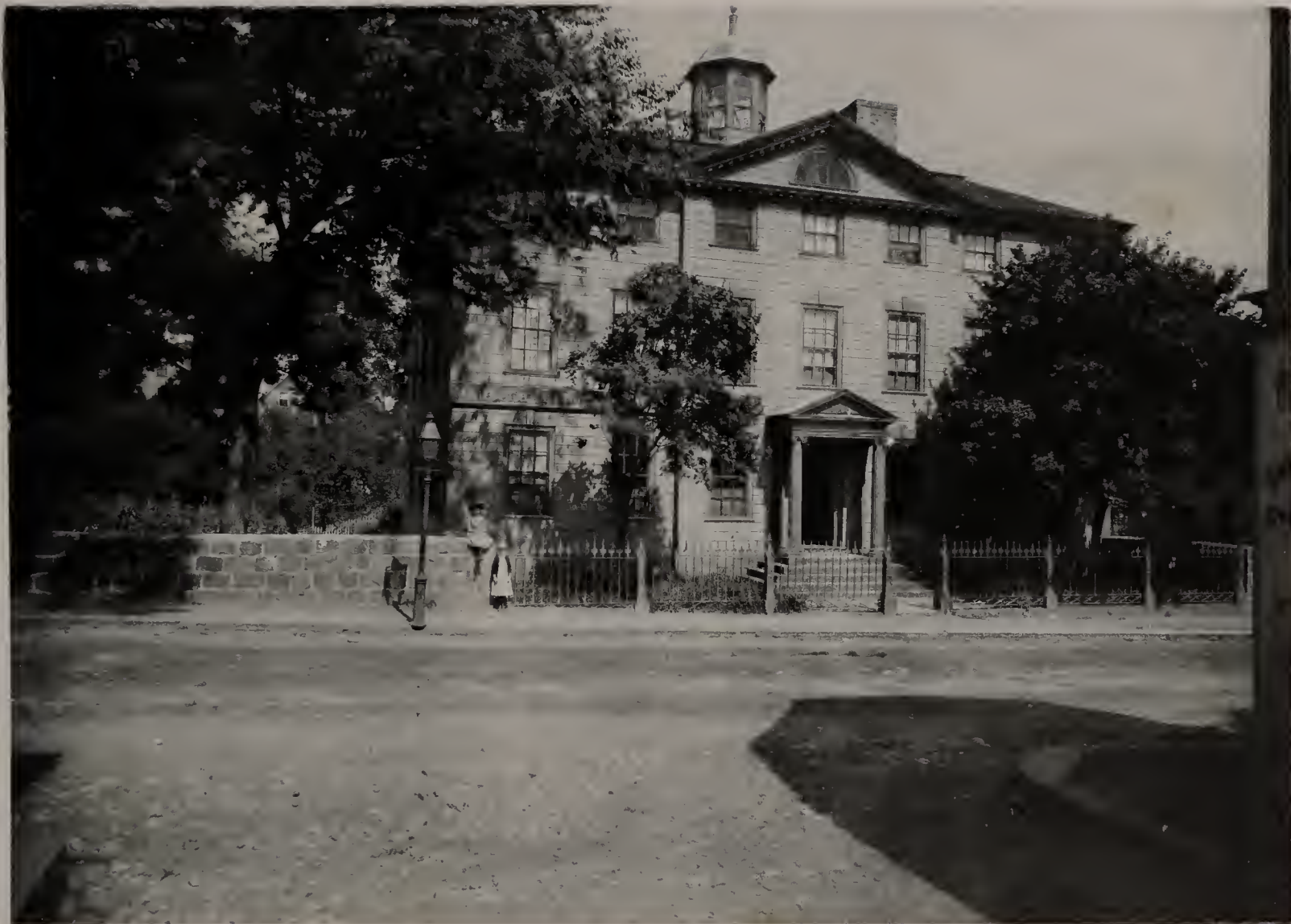
THE LEE MANSION. MARBLEHEAD, IN 1890.

WASHINGTON WAS ENTERTAINED HERE IN 1789.