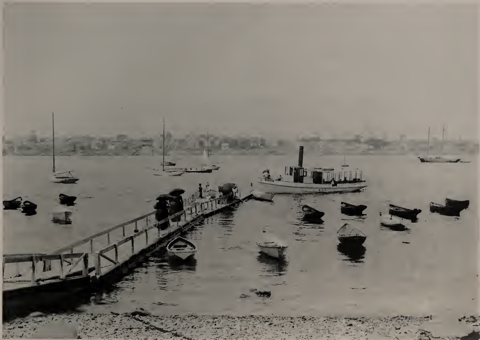
FERRY LANDING. MARBLEHEAD NECK.