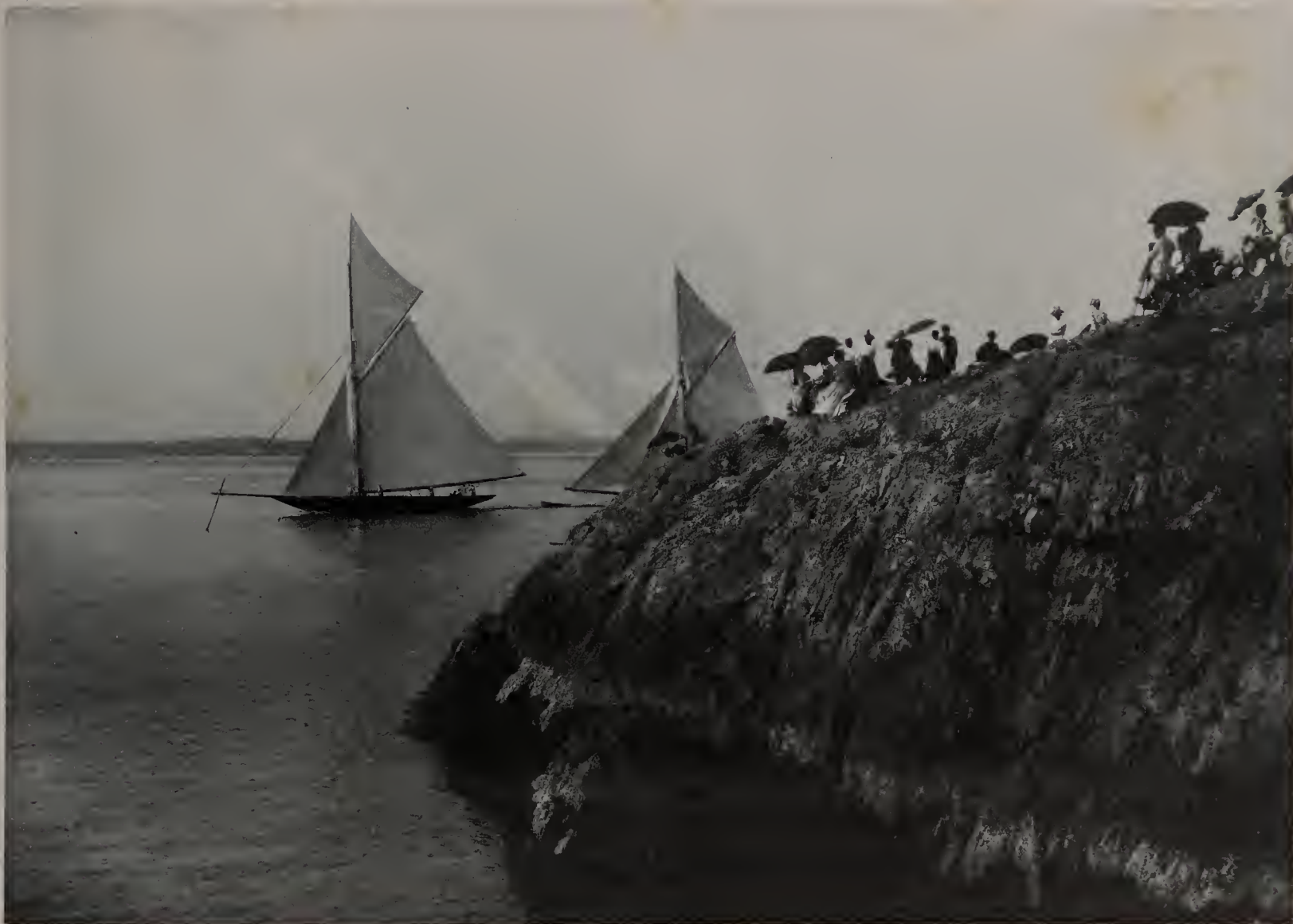
WASP, WINNING RACE OFF MARBLEHEAD NECK.