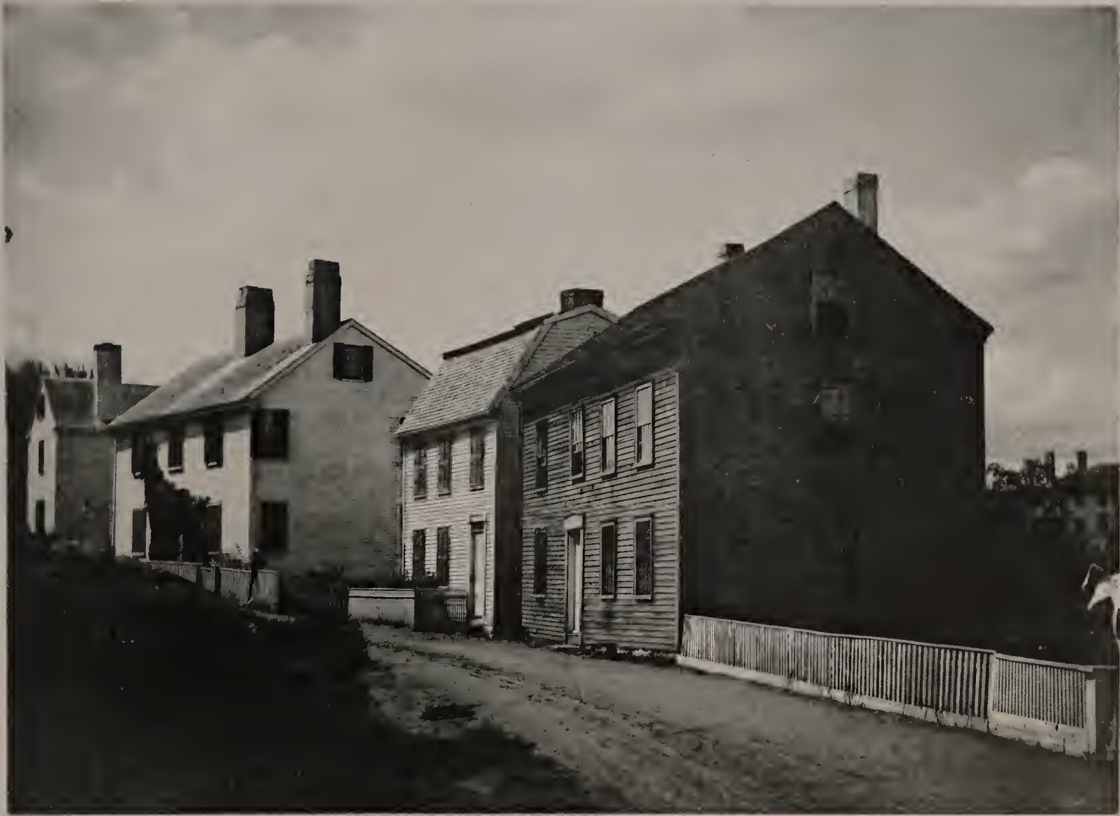
THE FLOYD IRESON HOUSE. MARBLEHEAD. 1890.