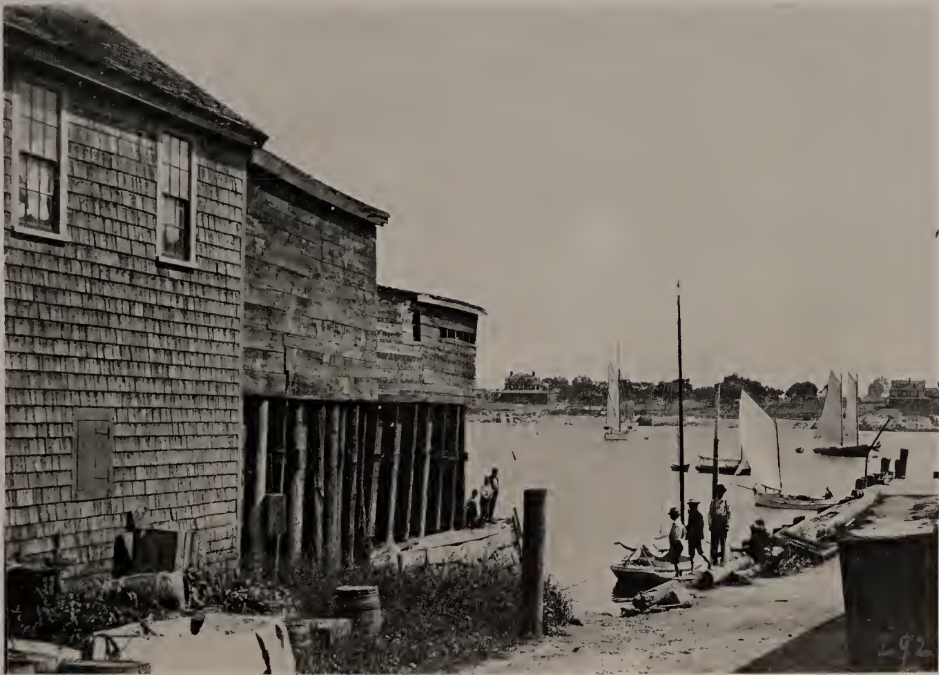
AMONG THE WHARVES AT MARBLEHEAD