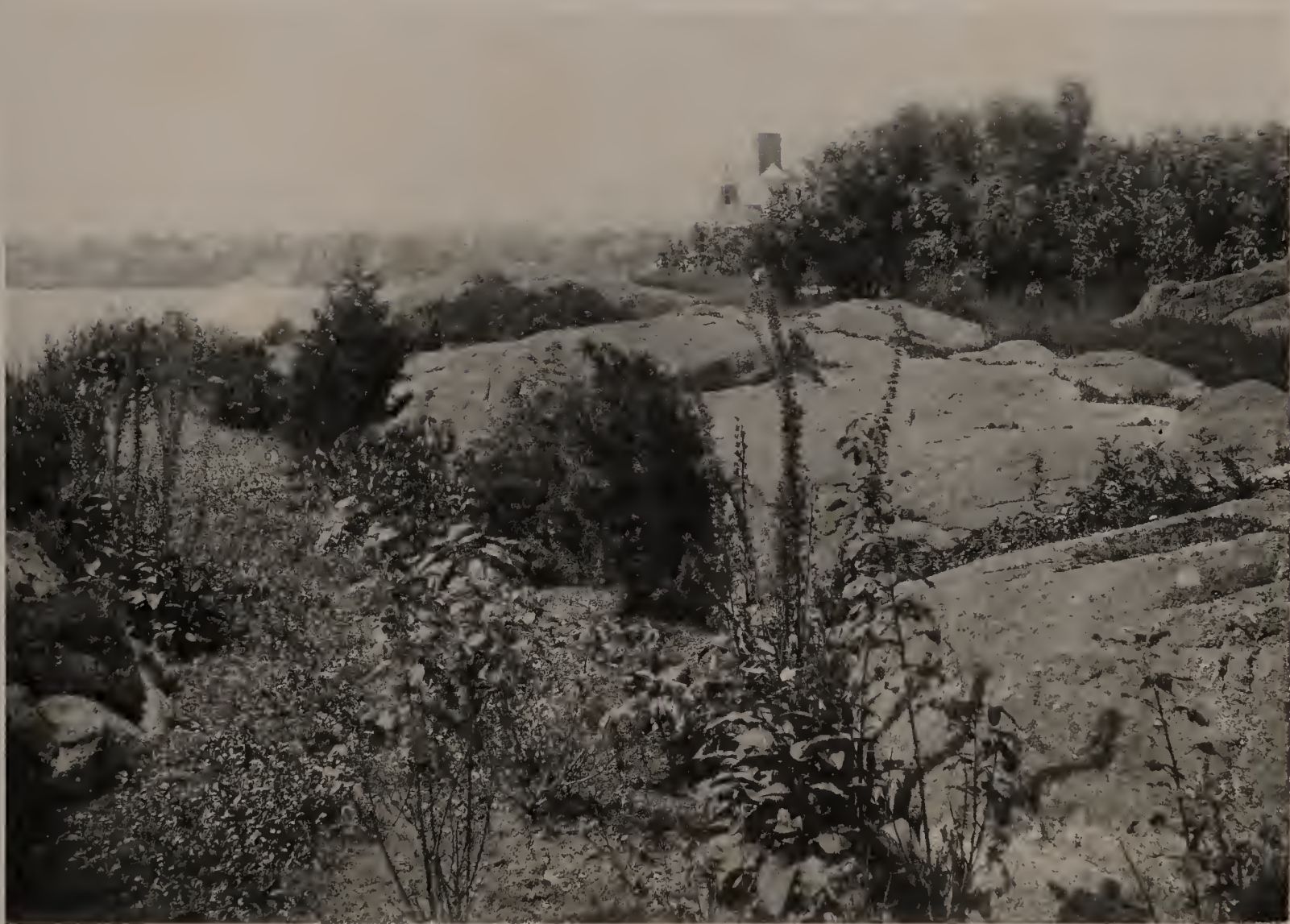
ON MARBLEHEAD NECK. 1889