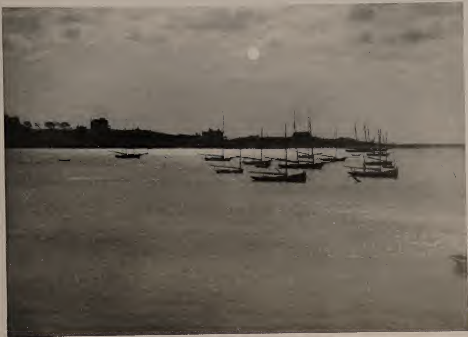
MARBLEHEAD HARBOR. 1889.