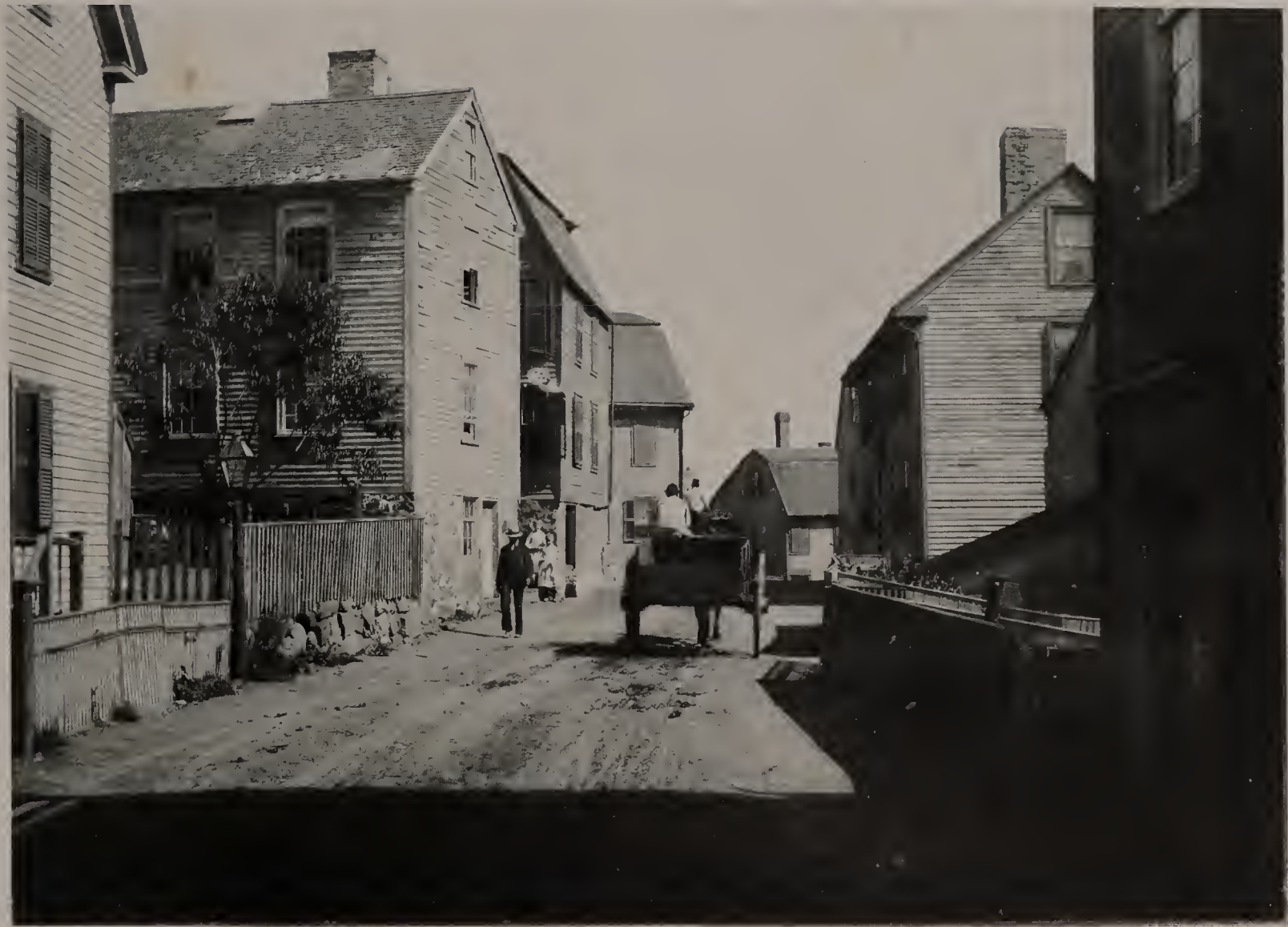
FRONT STREET. MARBLEHEAD. 1890.