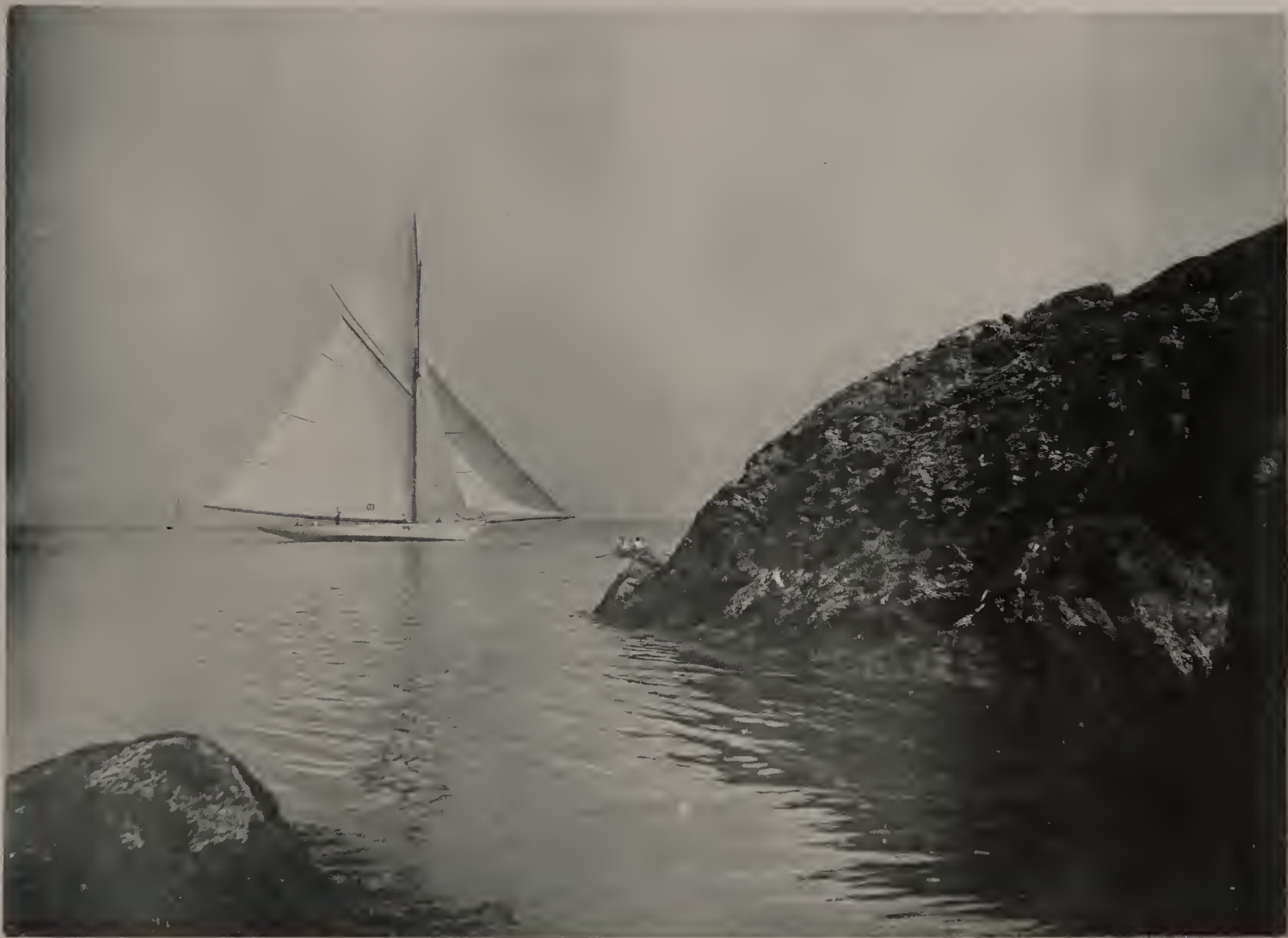
HARPOON. OFF MARBLEHEAD LIGHT.