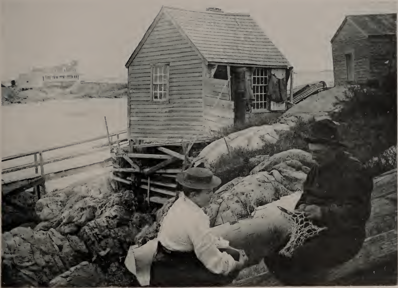
MAKING LOBSTER POTS. LITTLE HARBOR, MARBLEHEAD.