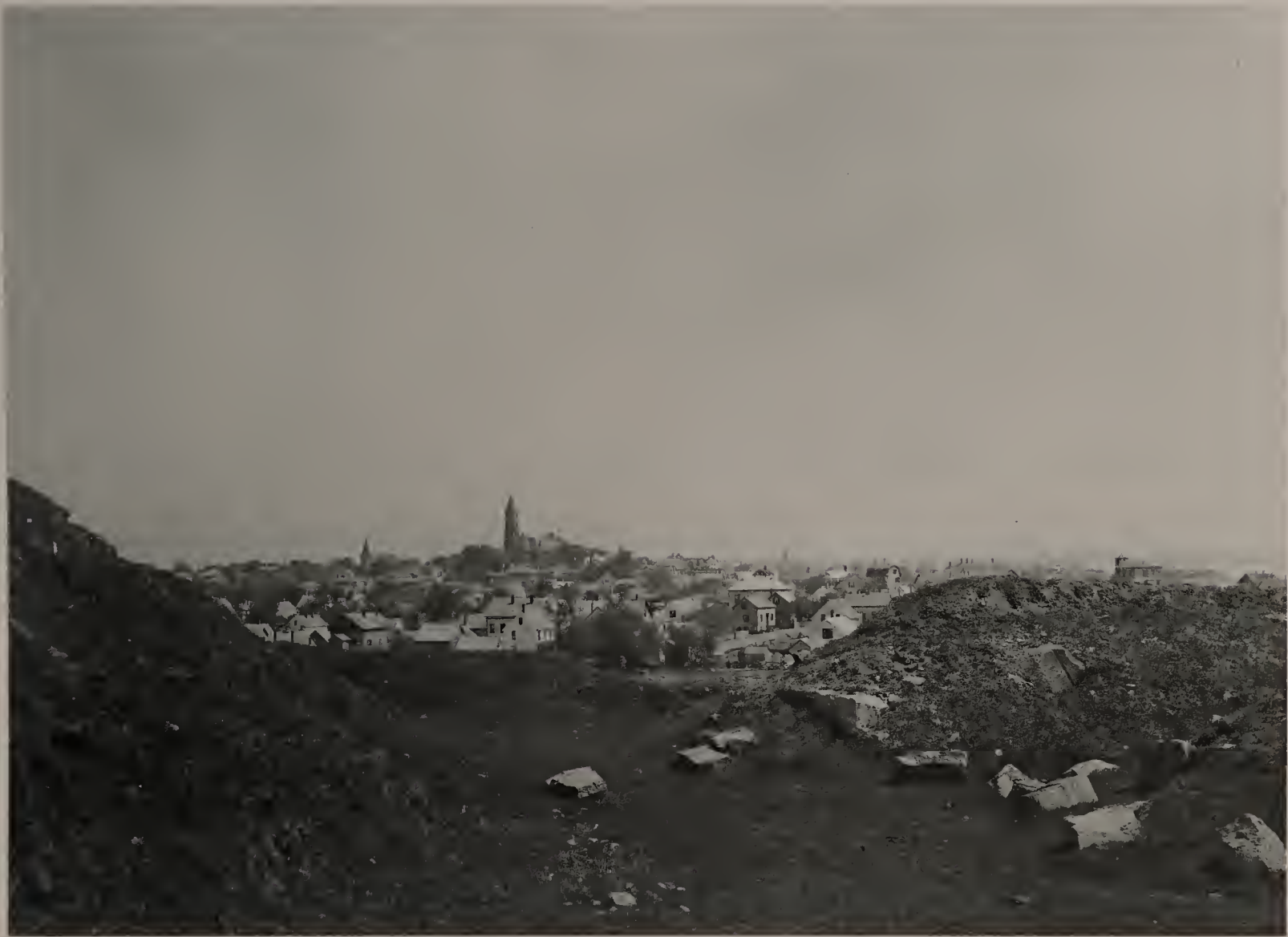
MARBLEHEAD FROM COW FORT.