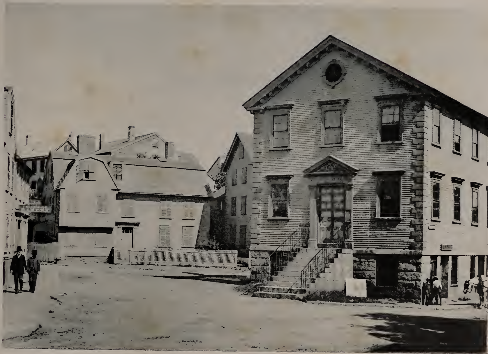
THE OLD TOWN HALL. MARBLEHEAD. 1890.