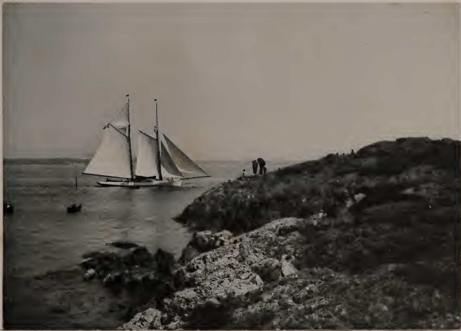
ALICE. OFF MARBLEHEAD LIGHT. LEAVING MARBLEHEAD HARBOR FOR THE CORINTHIAN YACHT CLUB RACE, JULY 23, 1891.