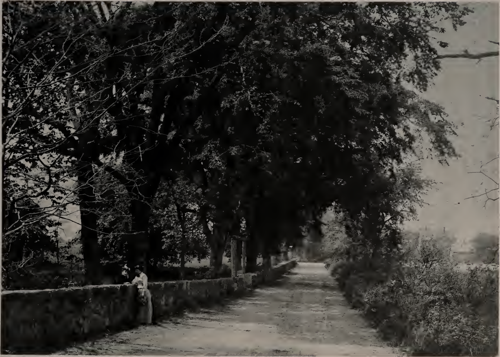
DEVEREUX LANE, MARBLEHEAD.