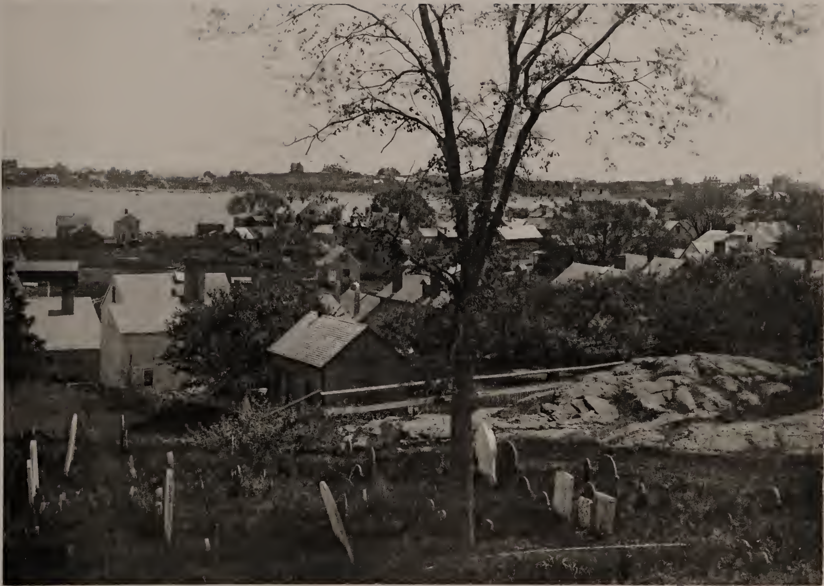
MARBLEHEAD HARBOR AND NECK, FROM BURYING-GROUND HILL.