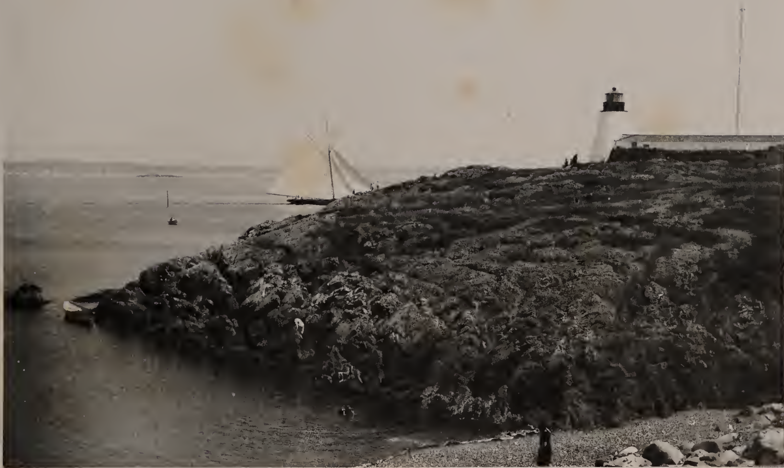
OWEENE. OFF LIGHTHOUSE POINT, MARBLEHEAD.