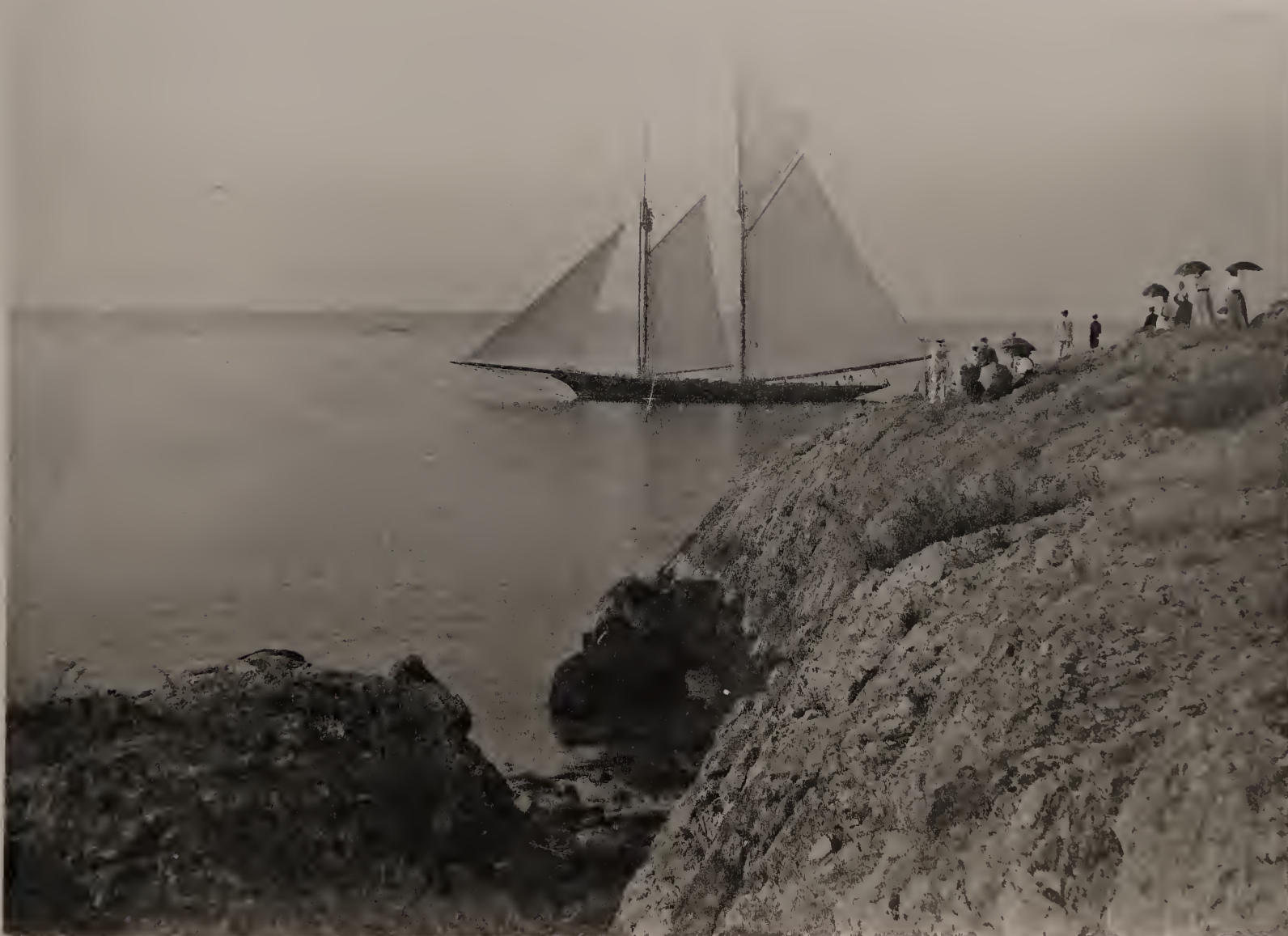
CONSTELLATION FINISHING. WINNER OF RACE FROM VINEYARD HAVEN TO MARBLEHEAD. ARRIVING OFF LIGHTHOUSE POINT, AUGUST 8, 1892.