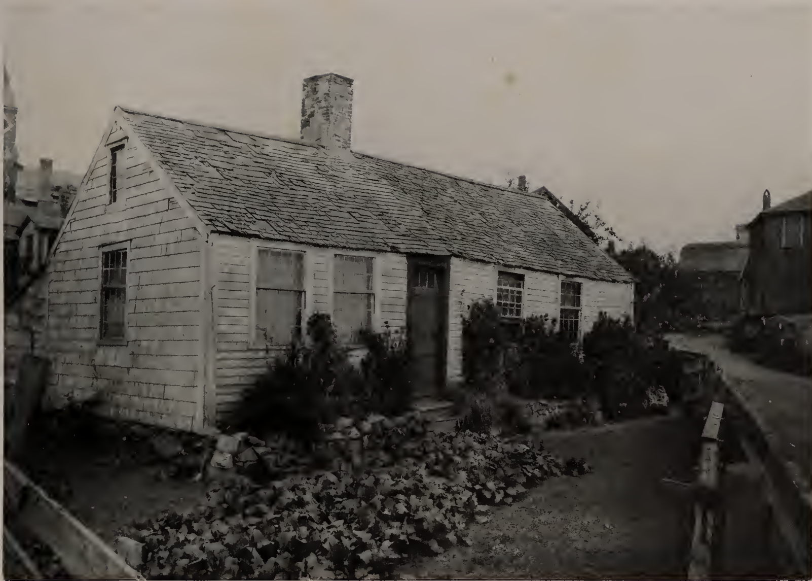
OLD GARDNER COTTAGE, GREGORY STREET, MARBLEHEAD.