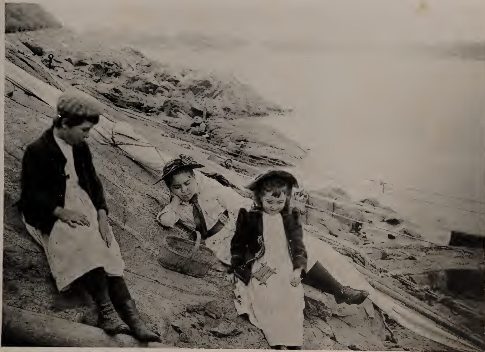
FISHERMEN'S CHILDREN ON THE ROCKS AT FORT SEWALL.