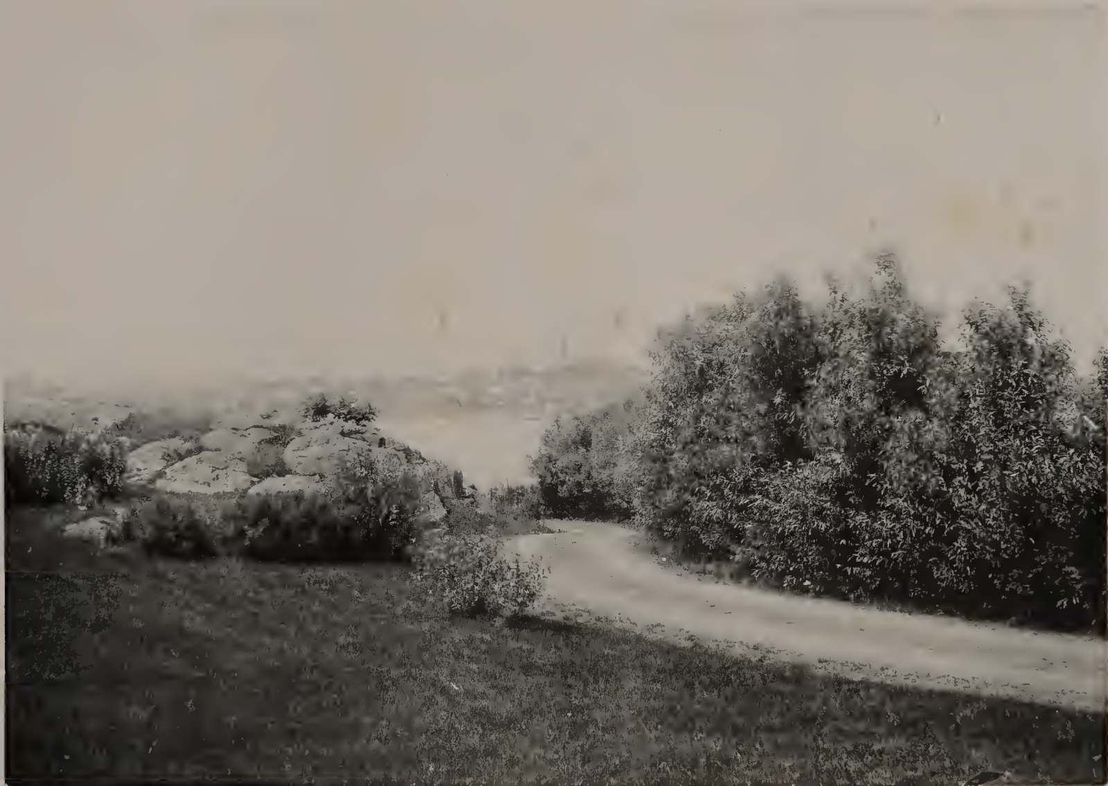
ON MARBLEHEAD NECK, 1889.