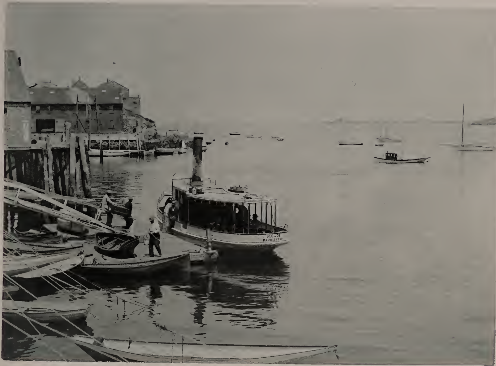
FERRY LANDING. MARBLEHEAD.