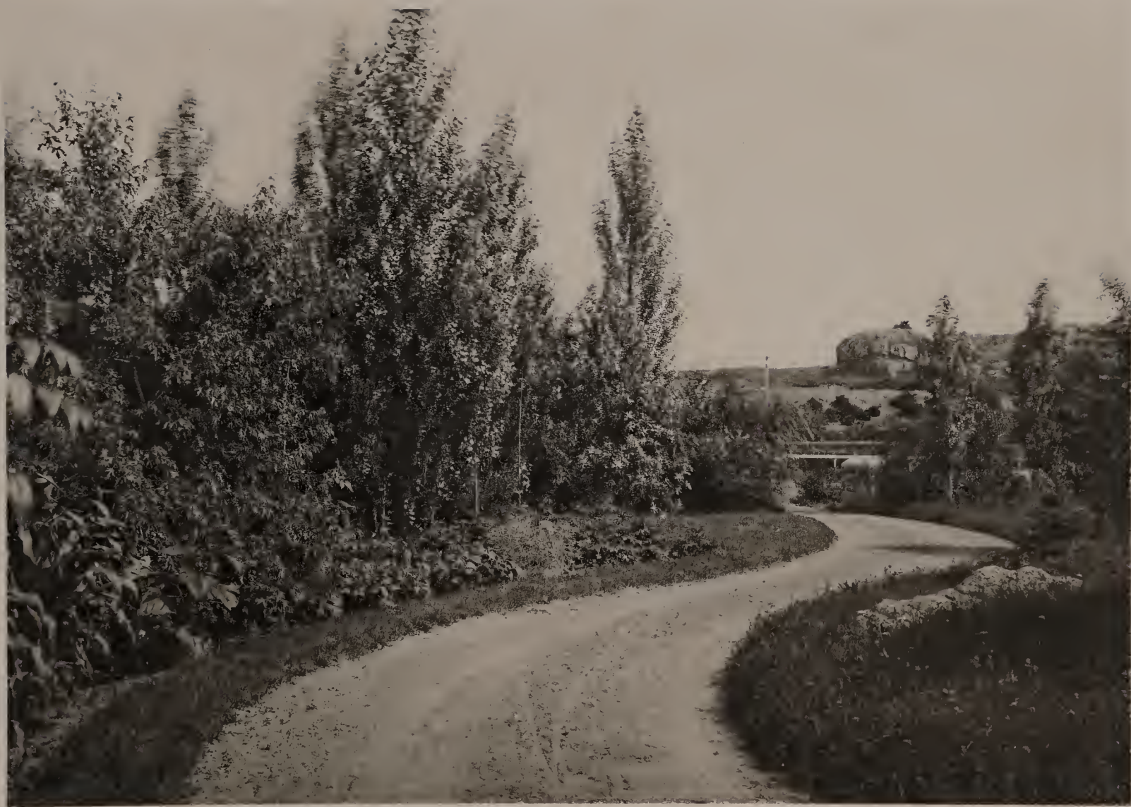
ON MARBLEHEAD NECK. 1889