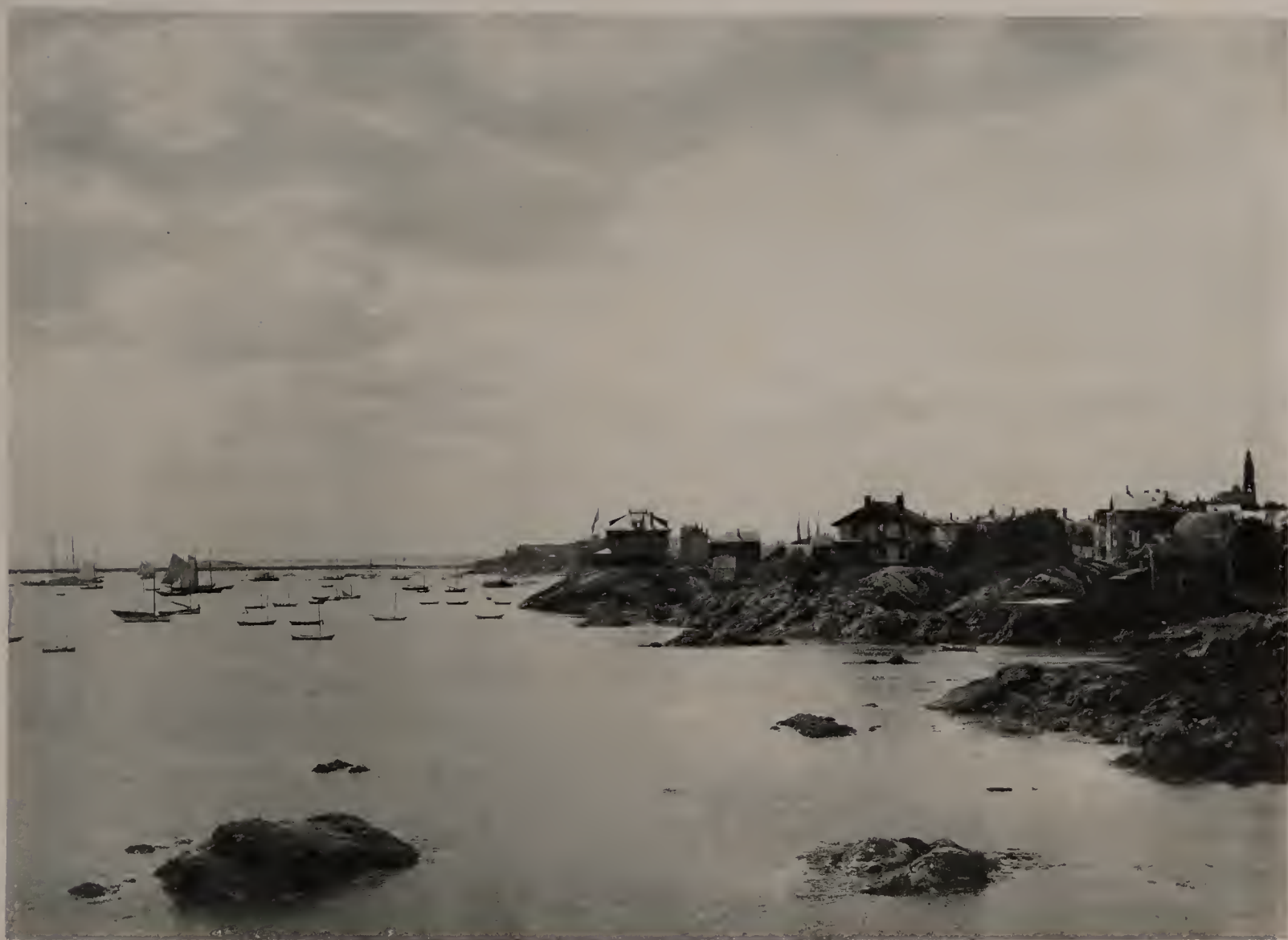
MARBLEHEAD HARBOR AND TOWN. FROM FORT SEWALL.