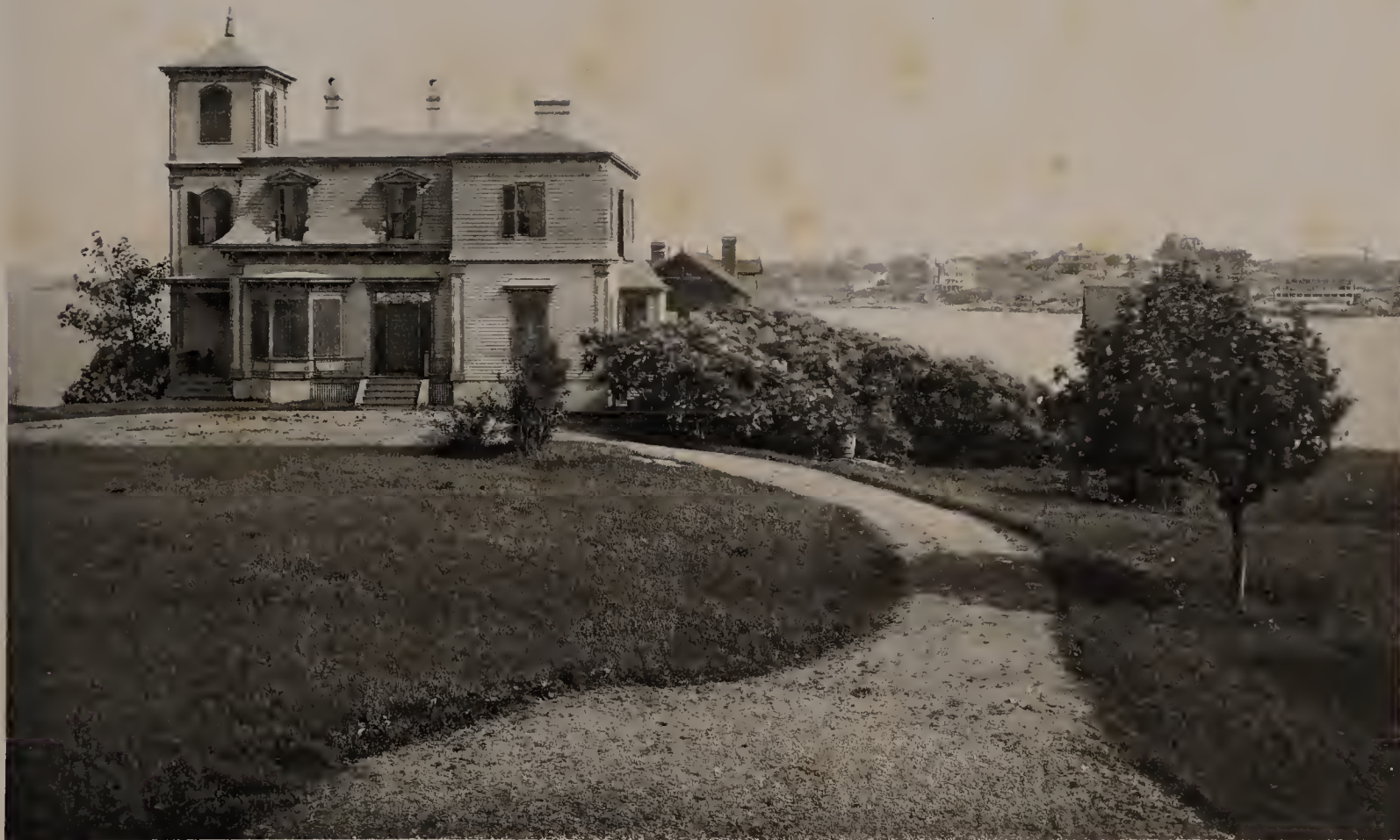
ACROSS MARBLEHEAD HARBOR FROM THE TOWN. 1890