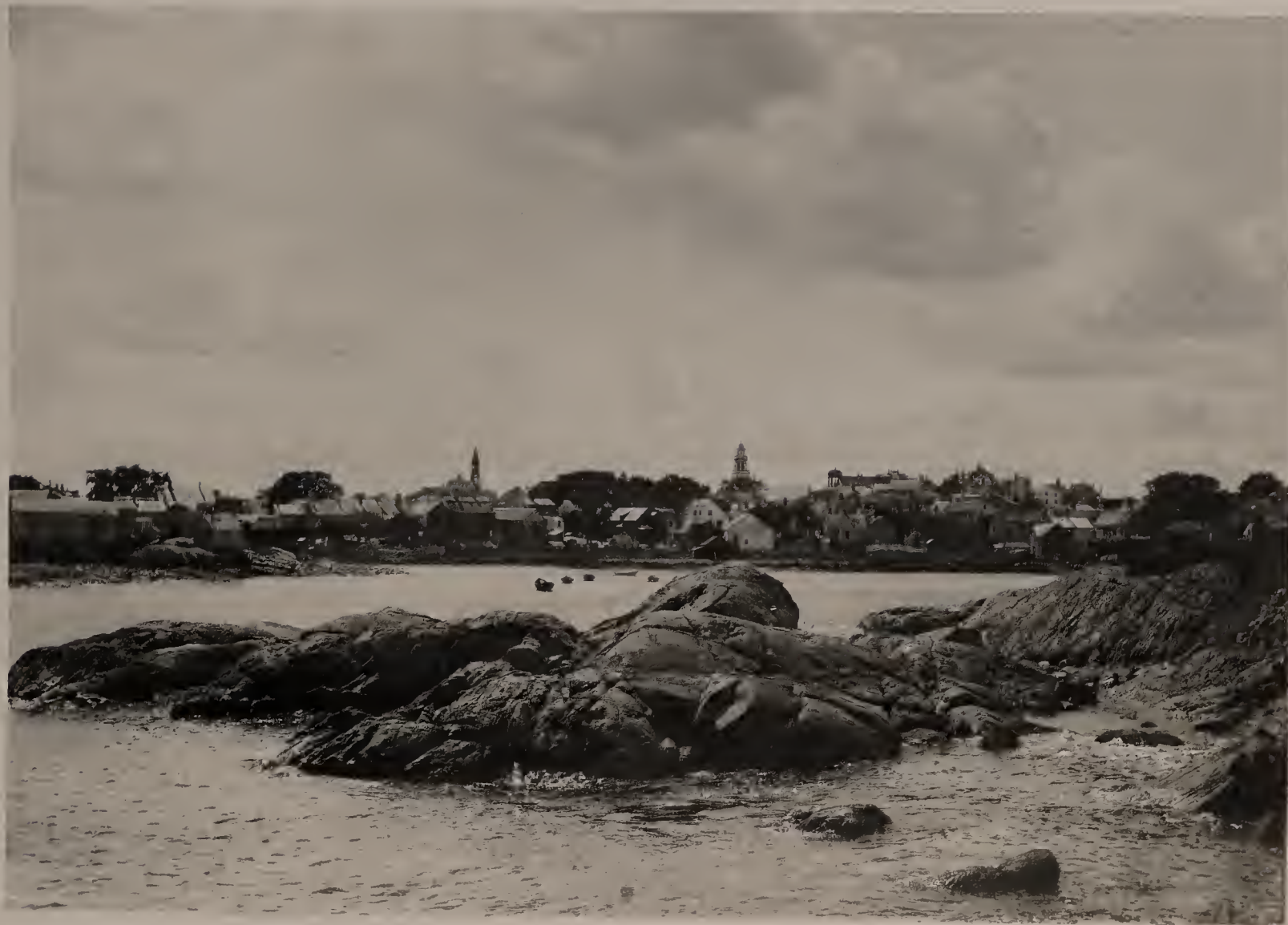
LITTLE HARBOR, MARBLEHEAD, MASS.