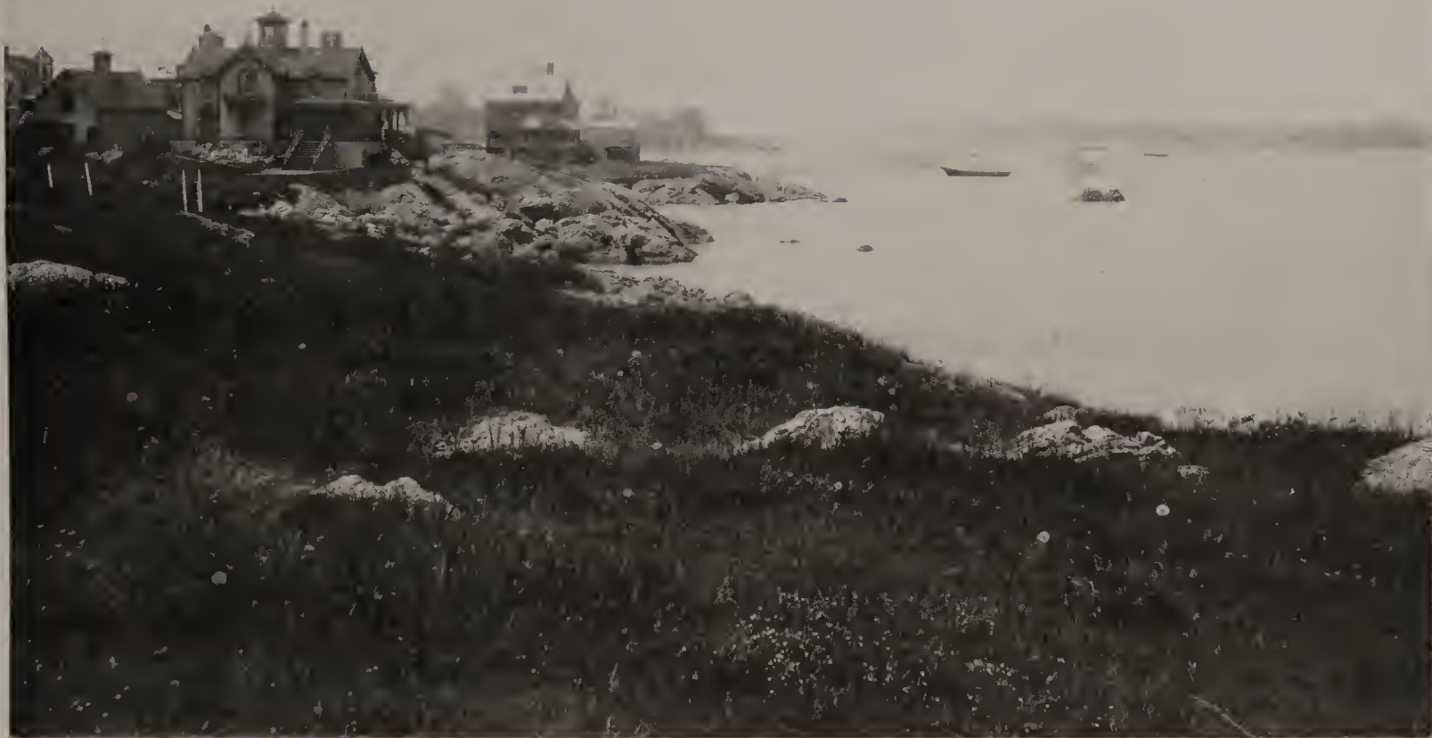
MARBLEHEAD HARBOR, SUMMER COTTAGE AND CORINTHIAN YACHT CLUB HOUSE. 1890.