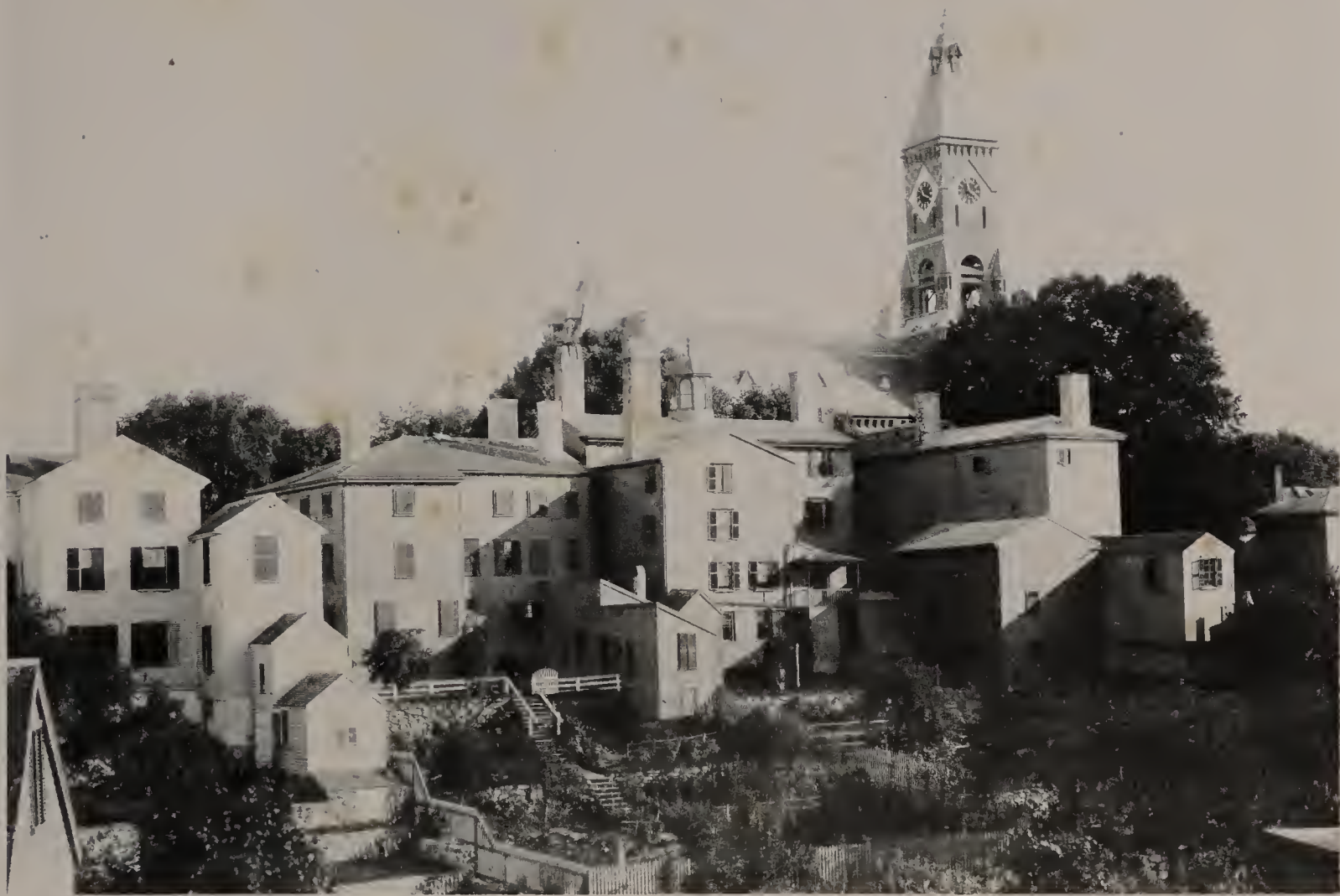
OLD HOMES OF THE SEA KINGS MARBLEHEAD, 1890.