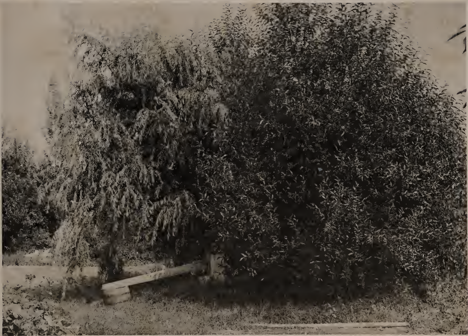
ON MARBLEHEAD NECK. 1889