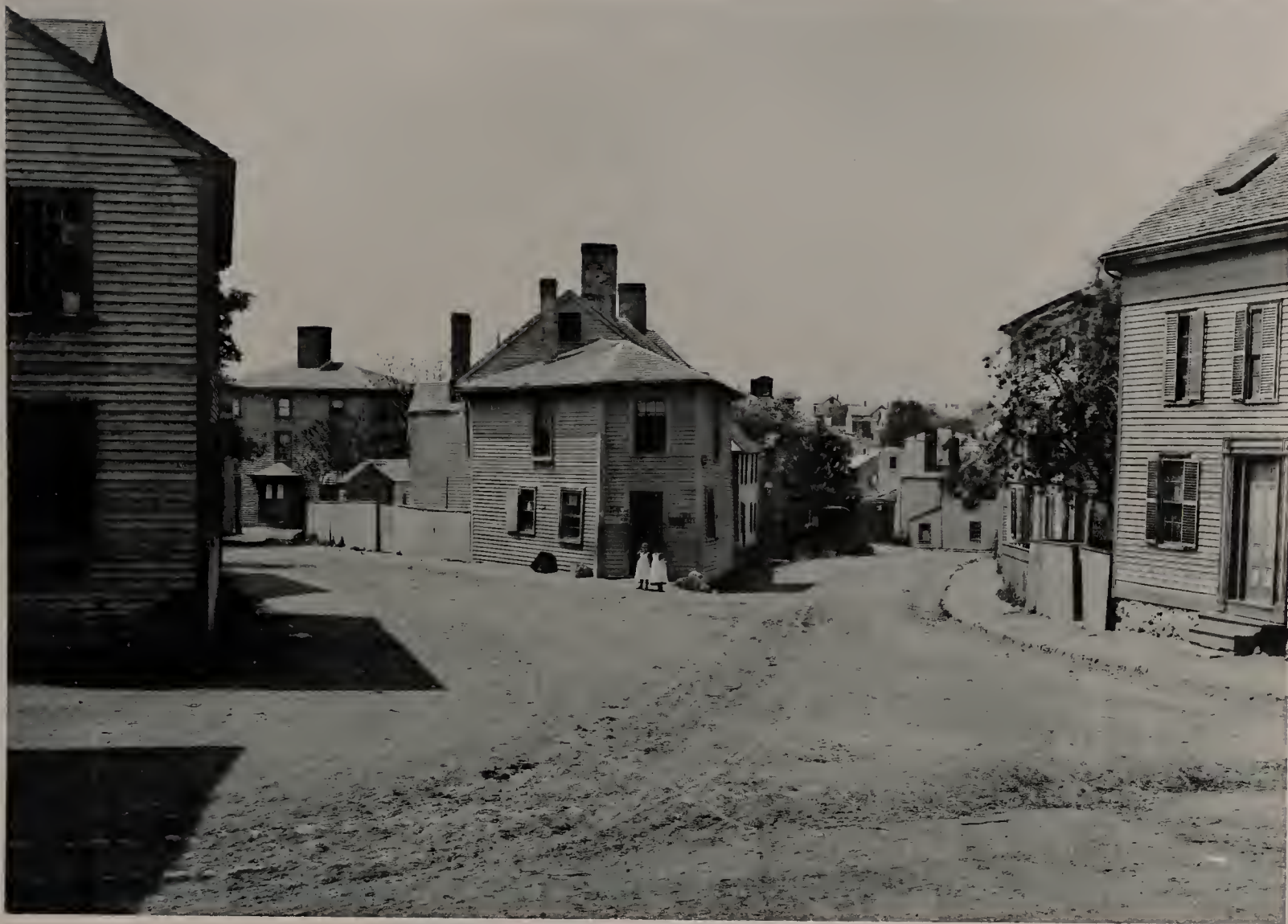
AN OLD RELIC OF MARBLEHEAD.