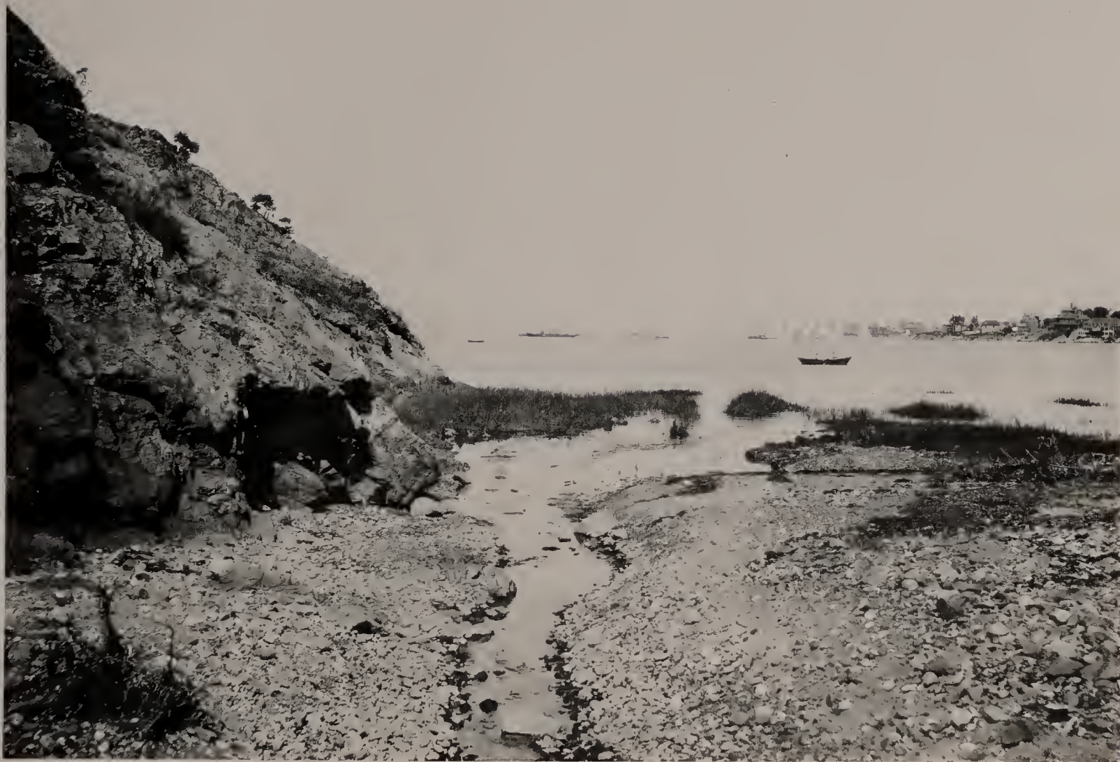
MARBLEHEAD HARBOR. FROM RIVERHEAD BEACH.