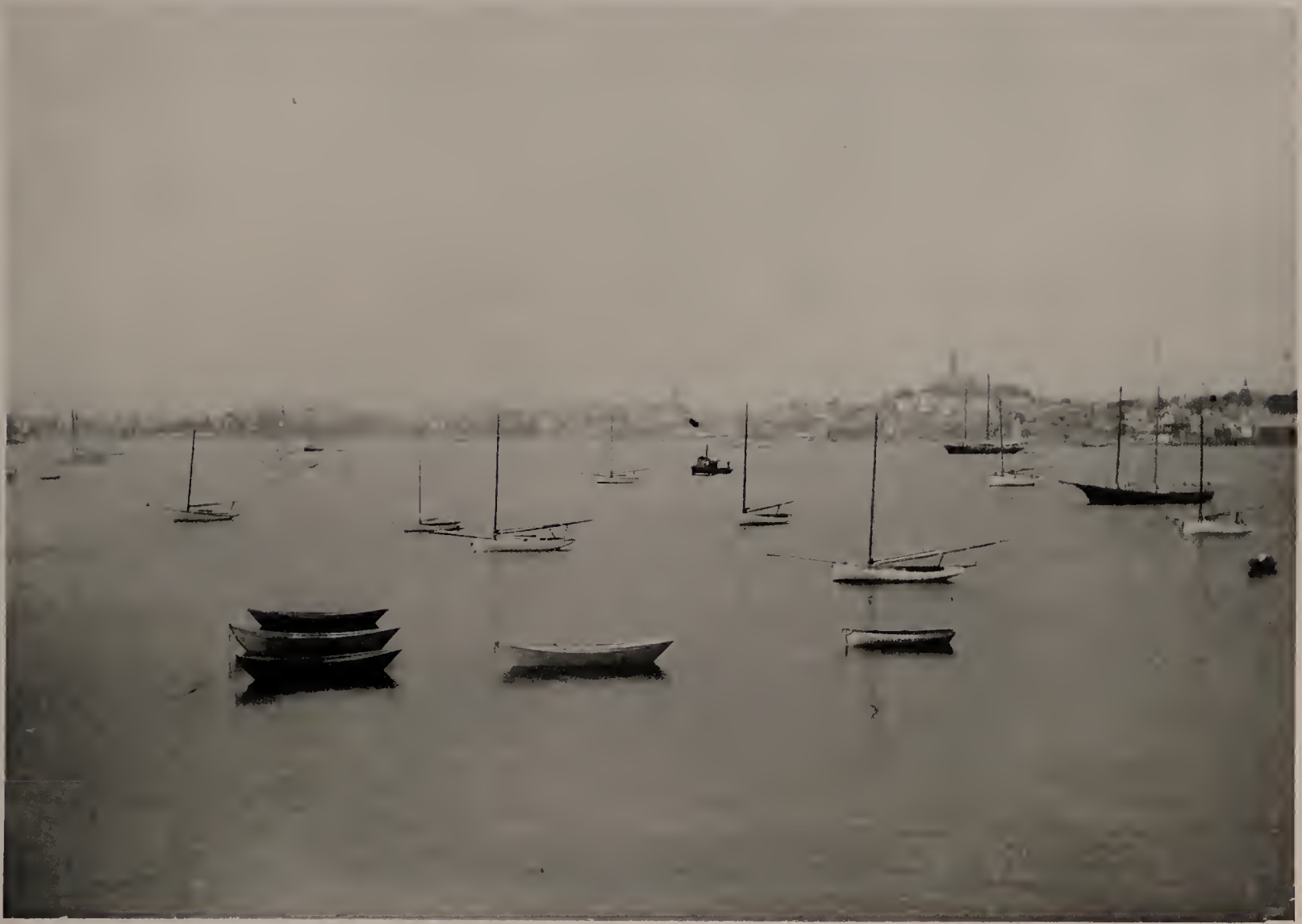
MARBLEHEAD. TOWN AND HARBOR. 1890.