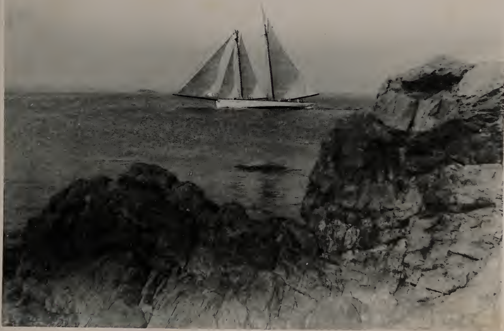
MAYFLOWER, WINNING RACE OFF MARBLEHEAD NECK.