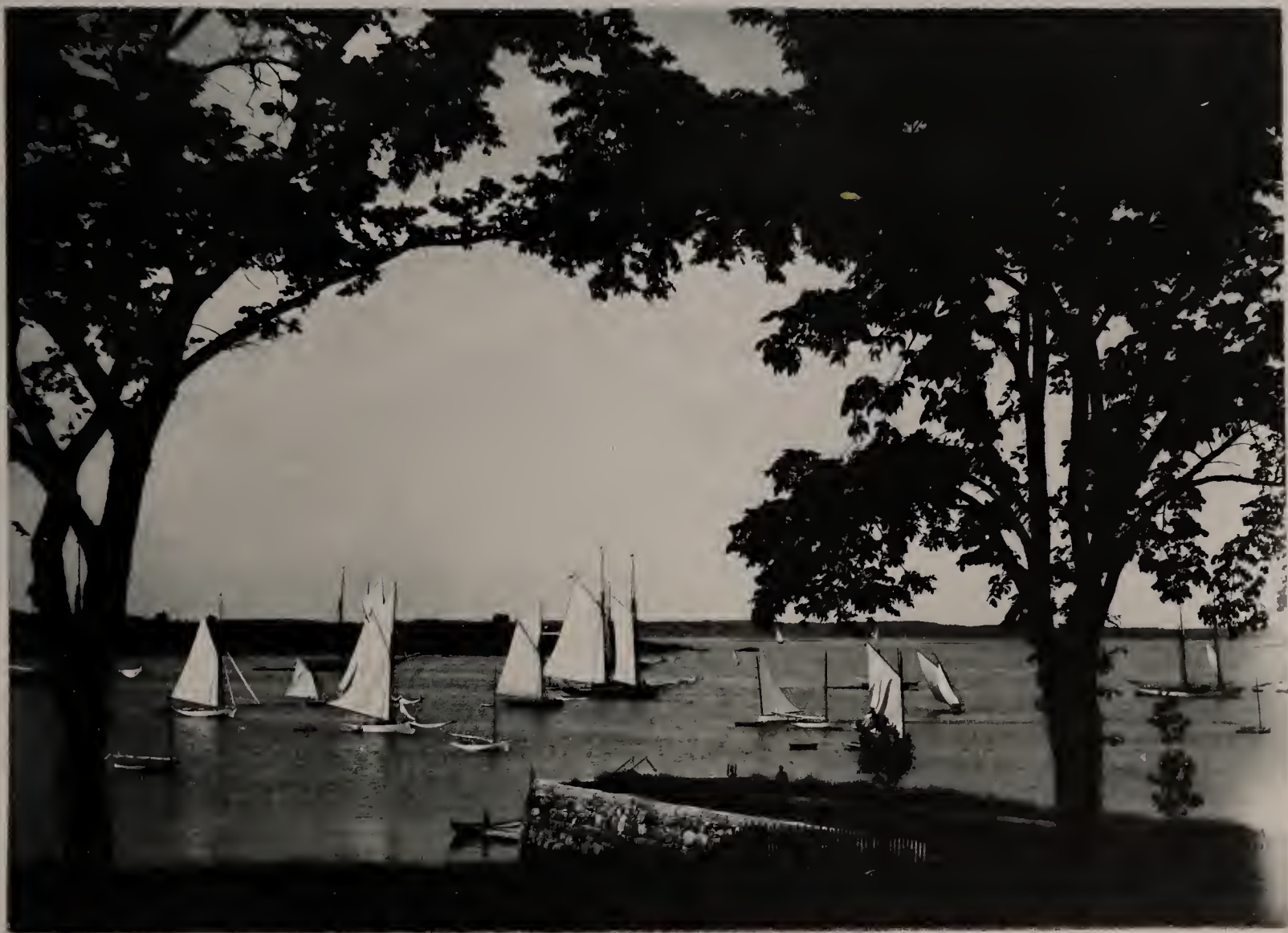
MARBLEHEAD HARBOR, FROM THE NECK, 1890.