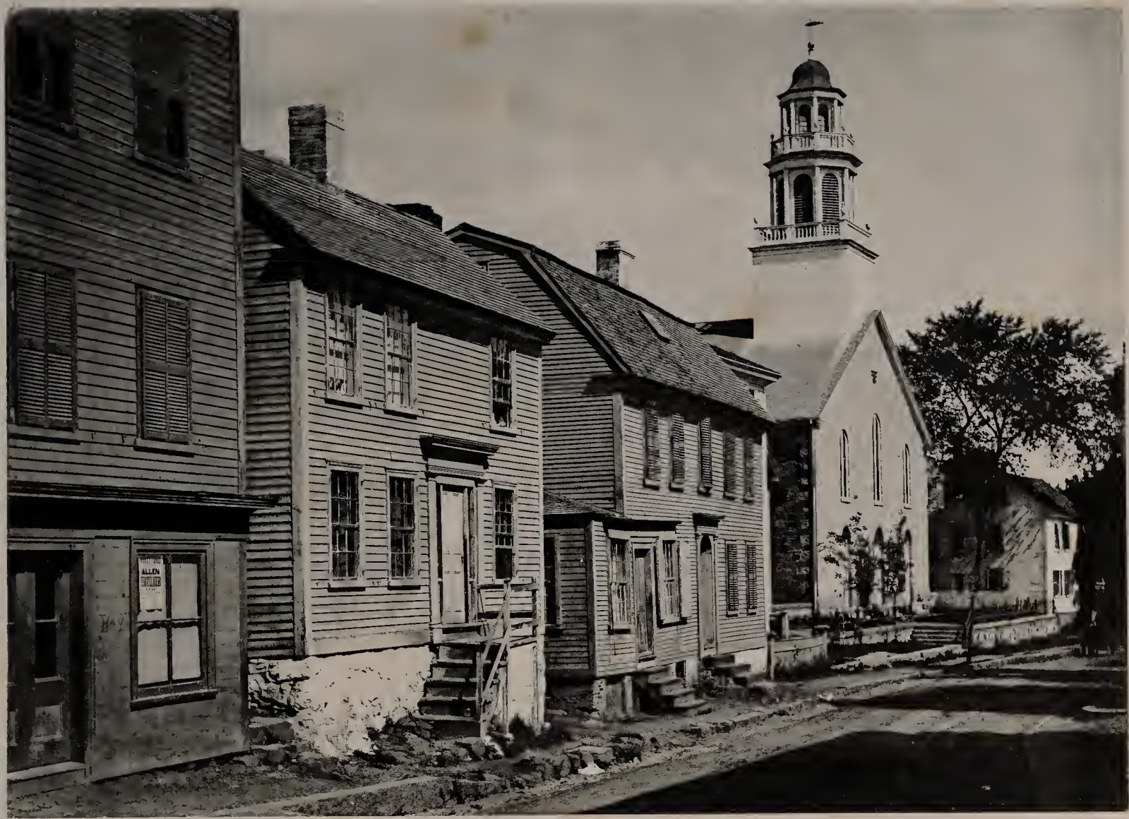
WASHINGTON STREET. MARBLEHEAD. THE OLD NORTH CHURCH, 1890.