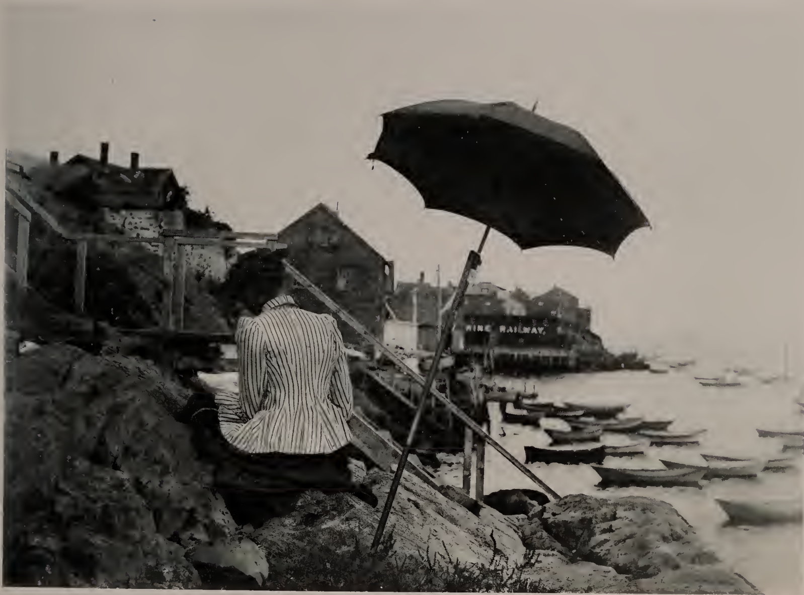
A SUMMER VISITOR.