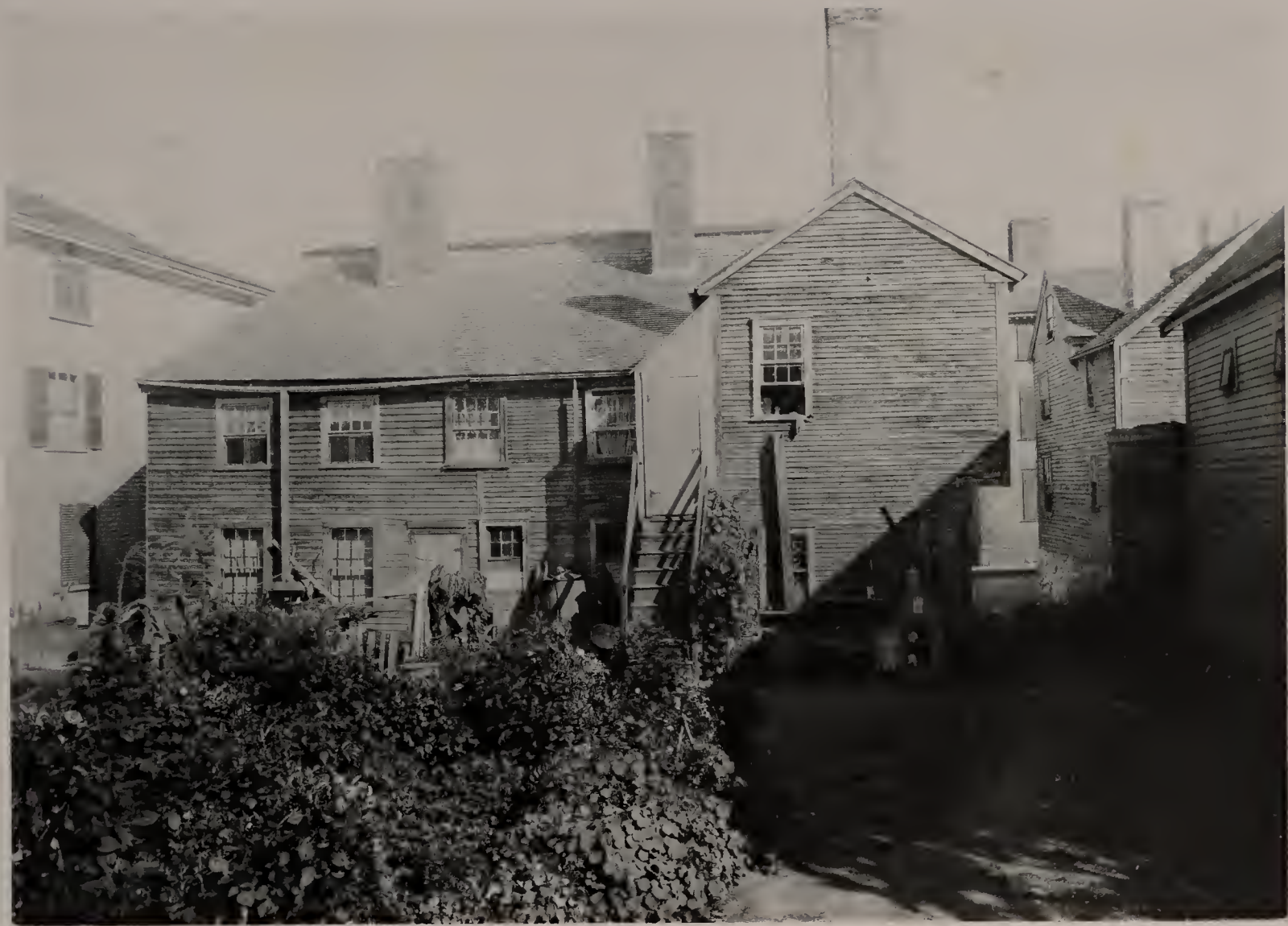
OLD HOUSE. WASHINGTON STREET, MARBLEHEAD. (From the rear.)