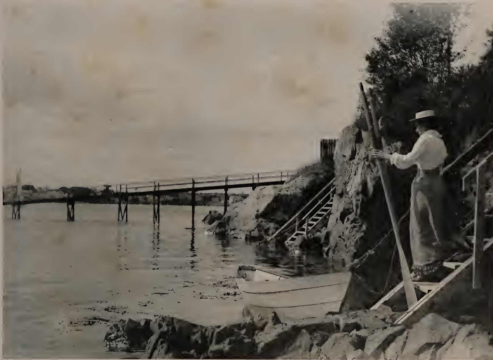
HER MORNING ROW.