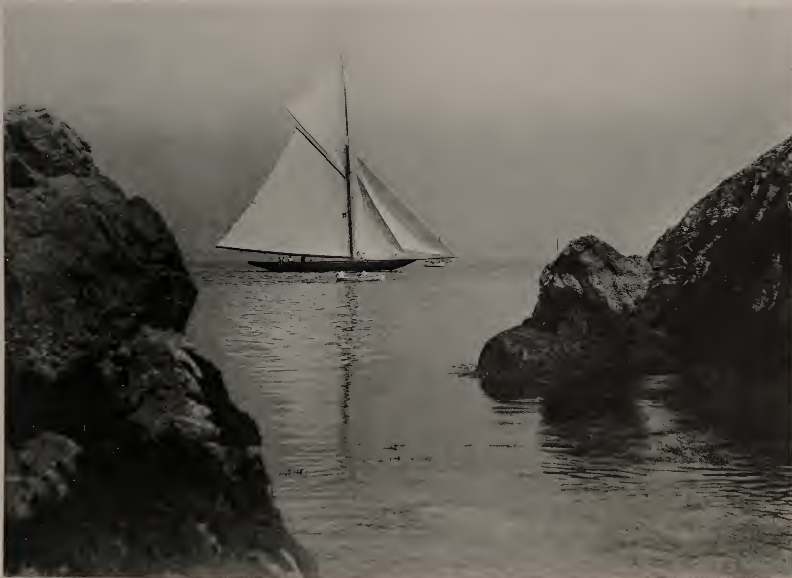
WASP. OFF MARBLEHEAD LIGHT.