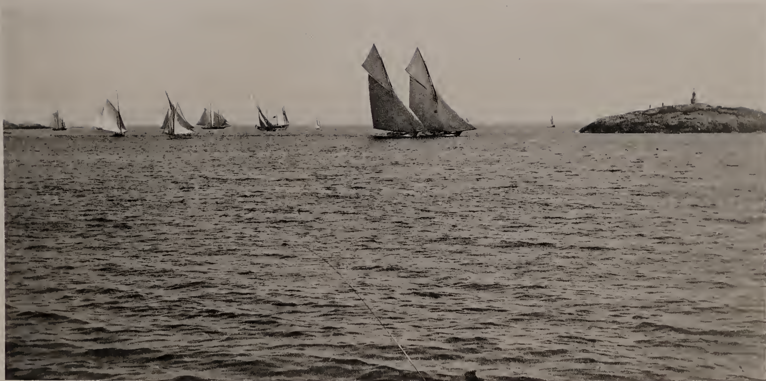
BEATRIX AND OWEENE. OFF MARBLEHEAD ROCK. MANŒUVRING FOR POSITION. CORINTHIAN YACHT CLUB RACE. JULY 23, 1891.