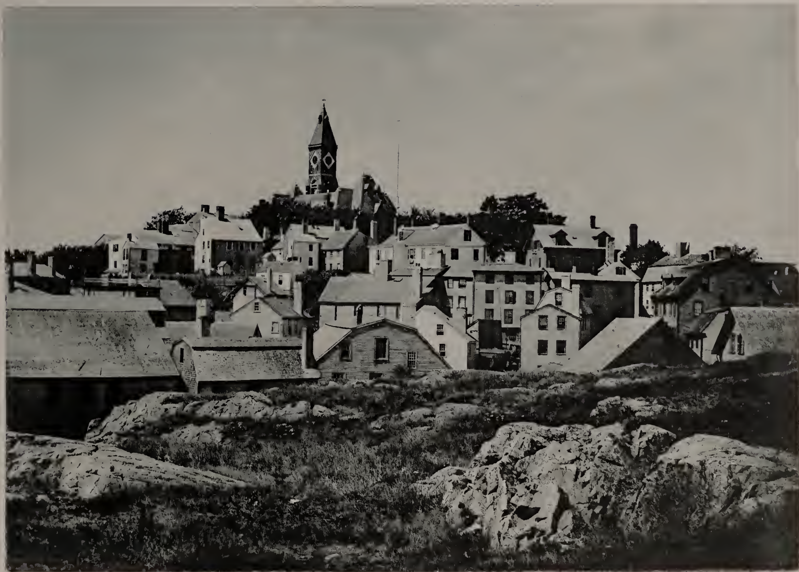
MARBLEHEAD, FROM CROCKER PARK.