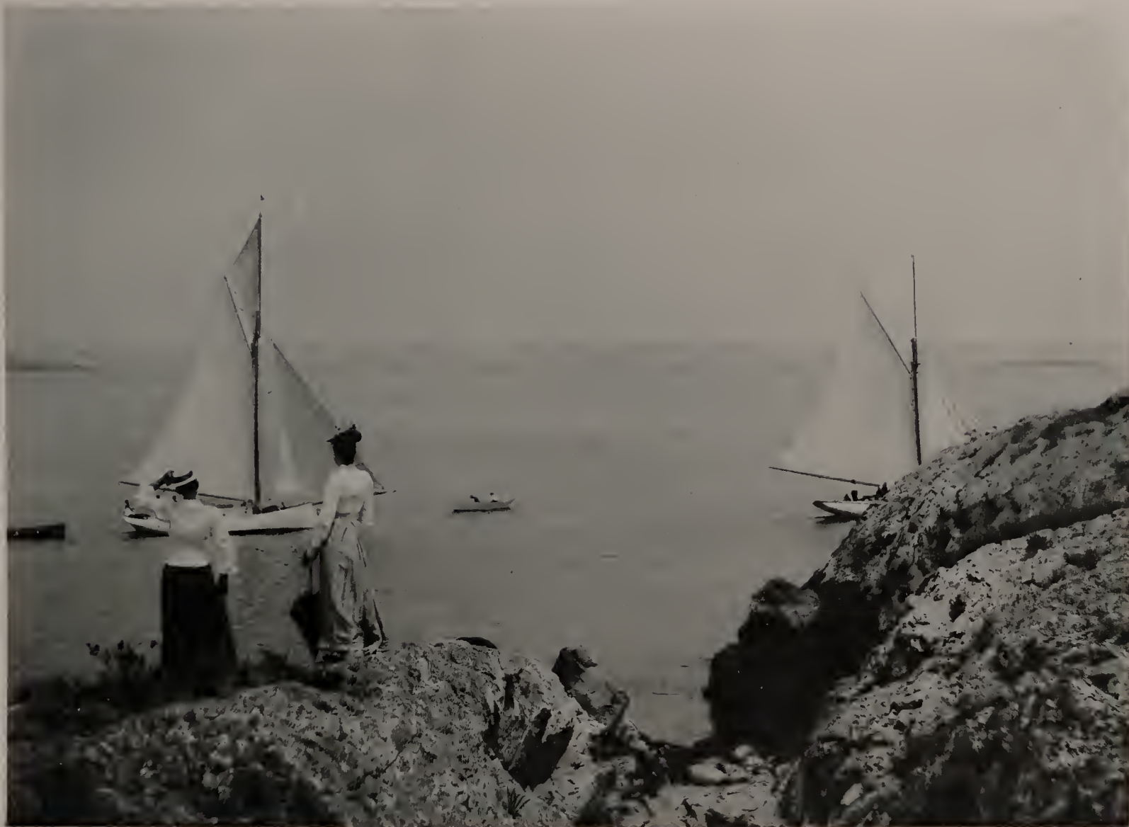
OFF MARBLEHEAD LIGHT,