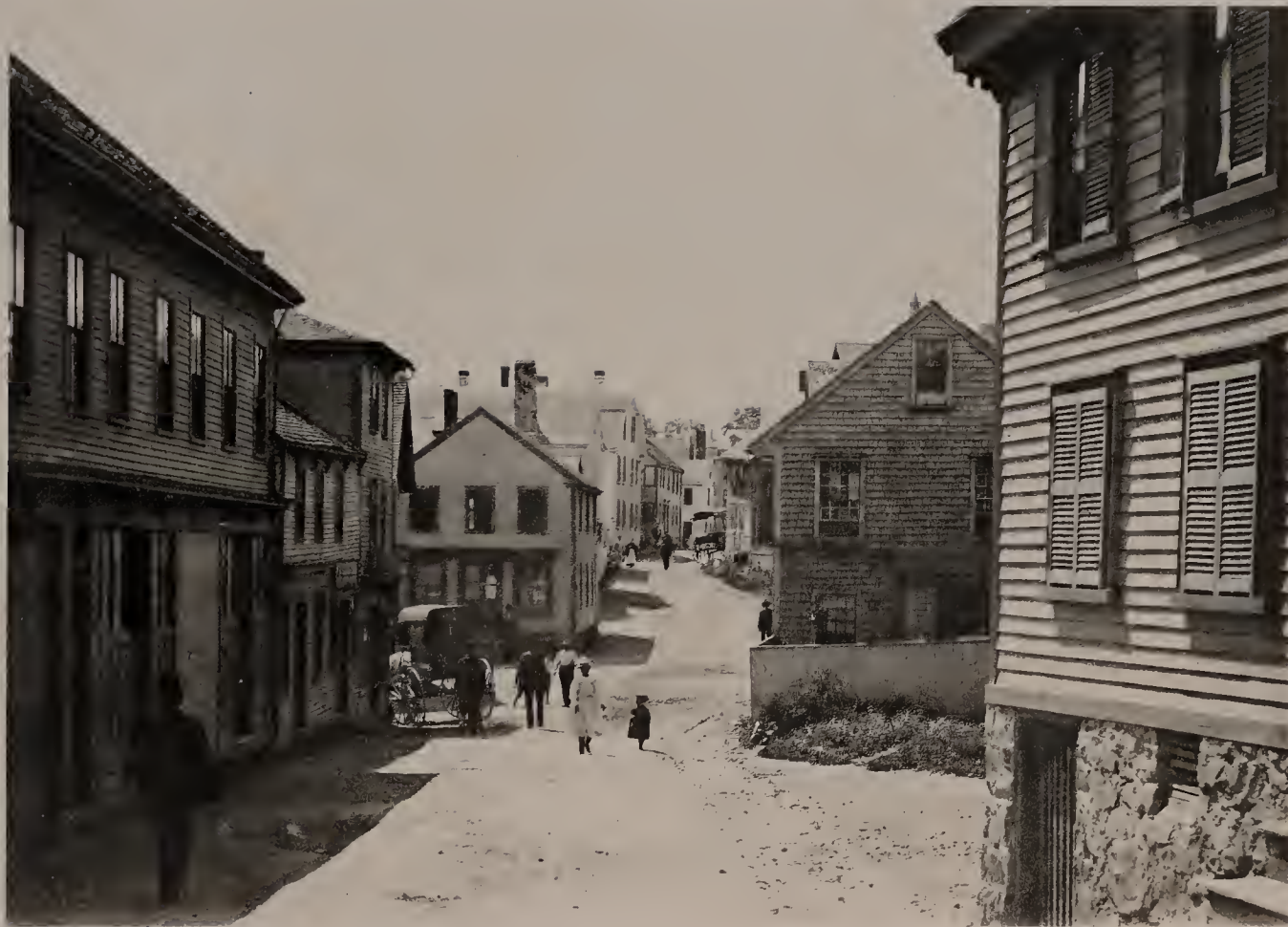
FRONT STREET. MARBLEHEAD. NEAR THE WHARVES. 1890.