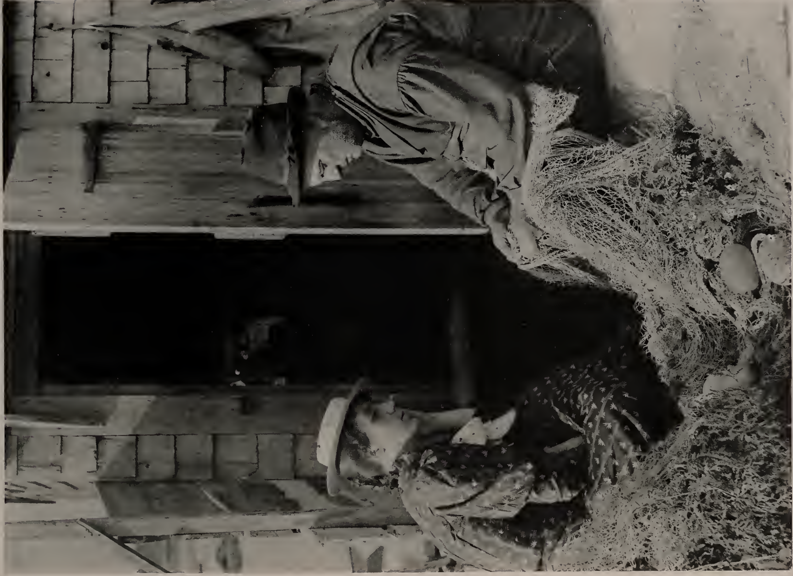
HER FIRST LESSON.