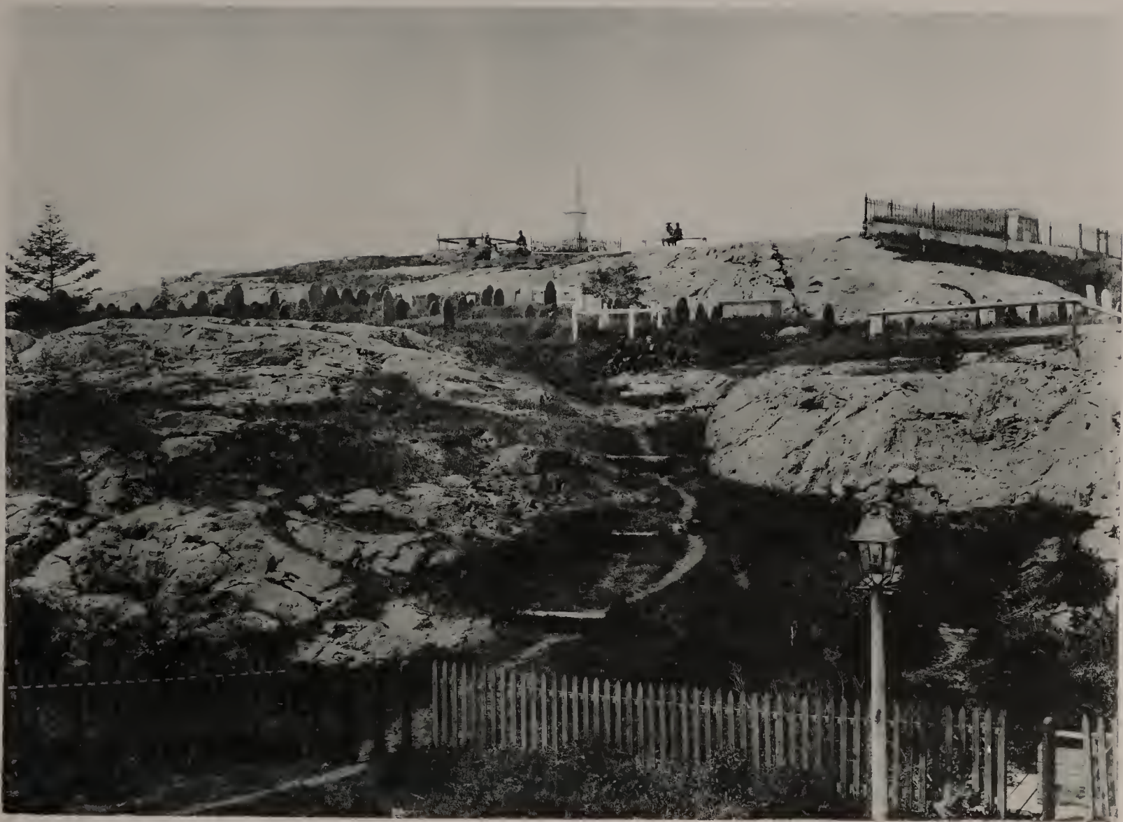
'WHERE THEY BURIED THEIR DEAD.'