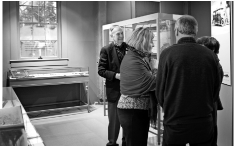
The newly restored Civil War & G.A.R. Museum, in the Old Town House, opened to the public on Christmas Walk weekend.